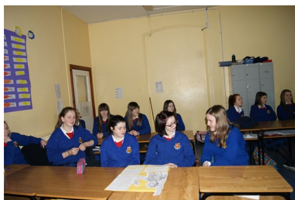
St Vincent's School in Dundalk

The key principle underpinning The Y Factor is empowerment. To ensure this is meaningful it is important that young people are involved in driving the project. The Y Factor Steering Group was established in early Autumn and brings together eight highly active and motivated young women between the ages of 16 and 25. These young women were identified