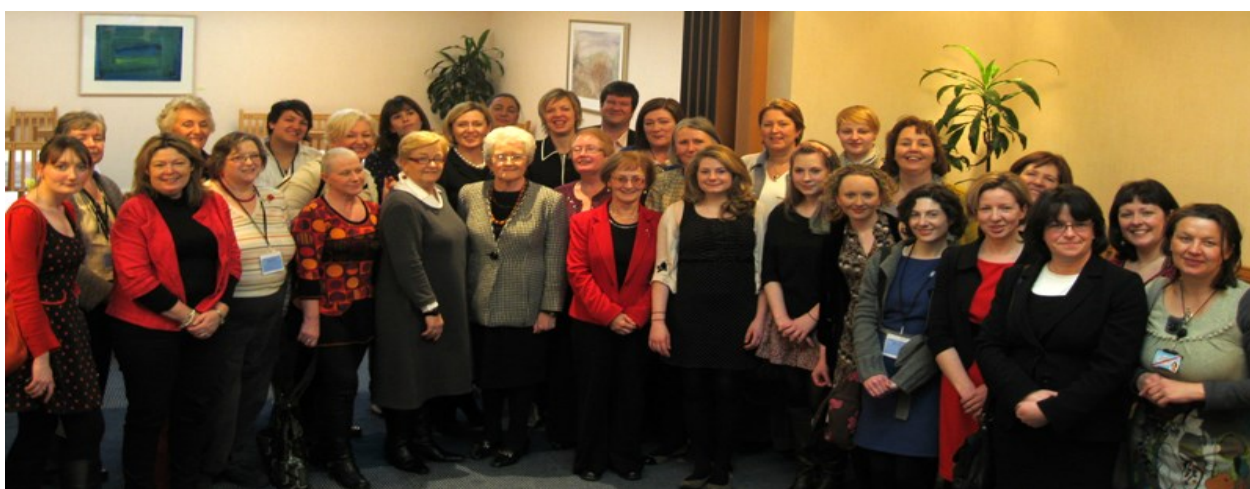
Politicians and activists gather to celebrate the introduction of gender quotas in Ireland.

representation of women in Irish politics they will give more women the opportunity to face the electorate. We are proud to have played a key part in this campaign and we congratulate our member organisations and the many women inside Ireland's political parties who created this achievement.