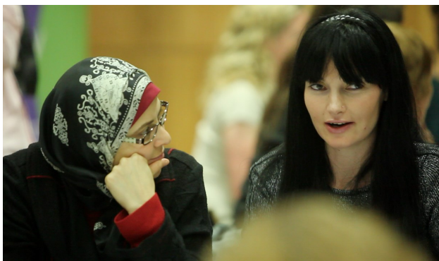
Participants at the Diverse Voices of Women Conference, October 2012