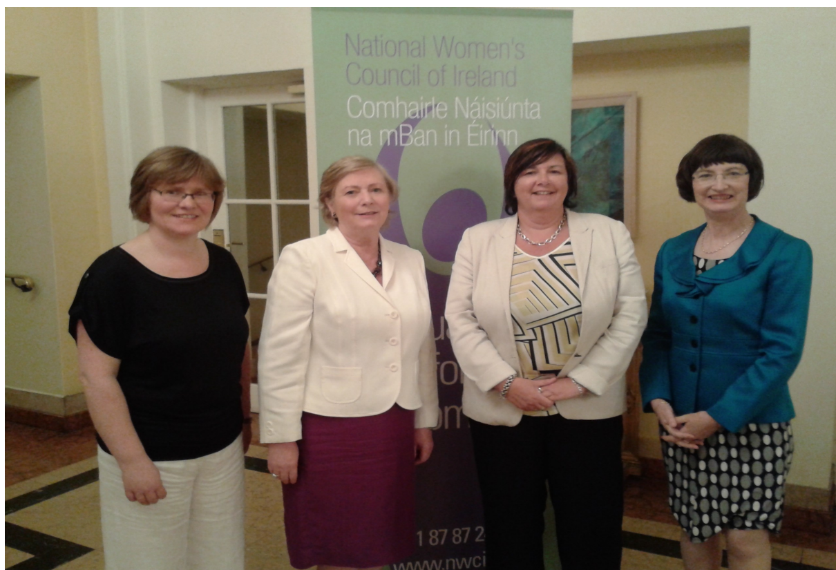
Orla O'Connor, NWCI, Frances Fitzgerald TD, Minister for Children and Youth Affairs, Clare Treacy, INMO and NWCI Chair, Pauline Moreau, Department of Justice and Equality

We were delighted that Minister for Children and Youth Affairs Frances Fitzgerald could address our 2012 AGM. The Minister is the first ever Minister for Children and Youth Affairs and was the Chairperson the National Women's Council of Ireland from 1988 – 1992. The Minister pioneered the issue of women in politics and in 1992 when she was first elected to the Dáil.