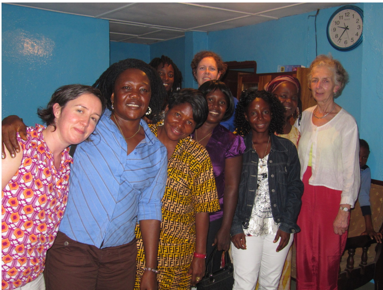
Delegates from NWCI and Irish Liberia Support Group with members of the Development Education Network Liberia - Gender Action Project