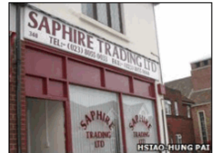
Saphire Trading provided workers to Barfoots of Botley, a Tesco supplier.

The Gangmasters Licensing Authority said workers were subjected to "systematic exploitation" which placed them at risk of injury or death.