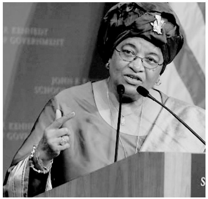
Africa's first democratically elected female president, Ellen Johnson Sirleaf (Liberia).