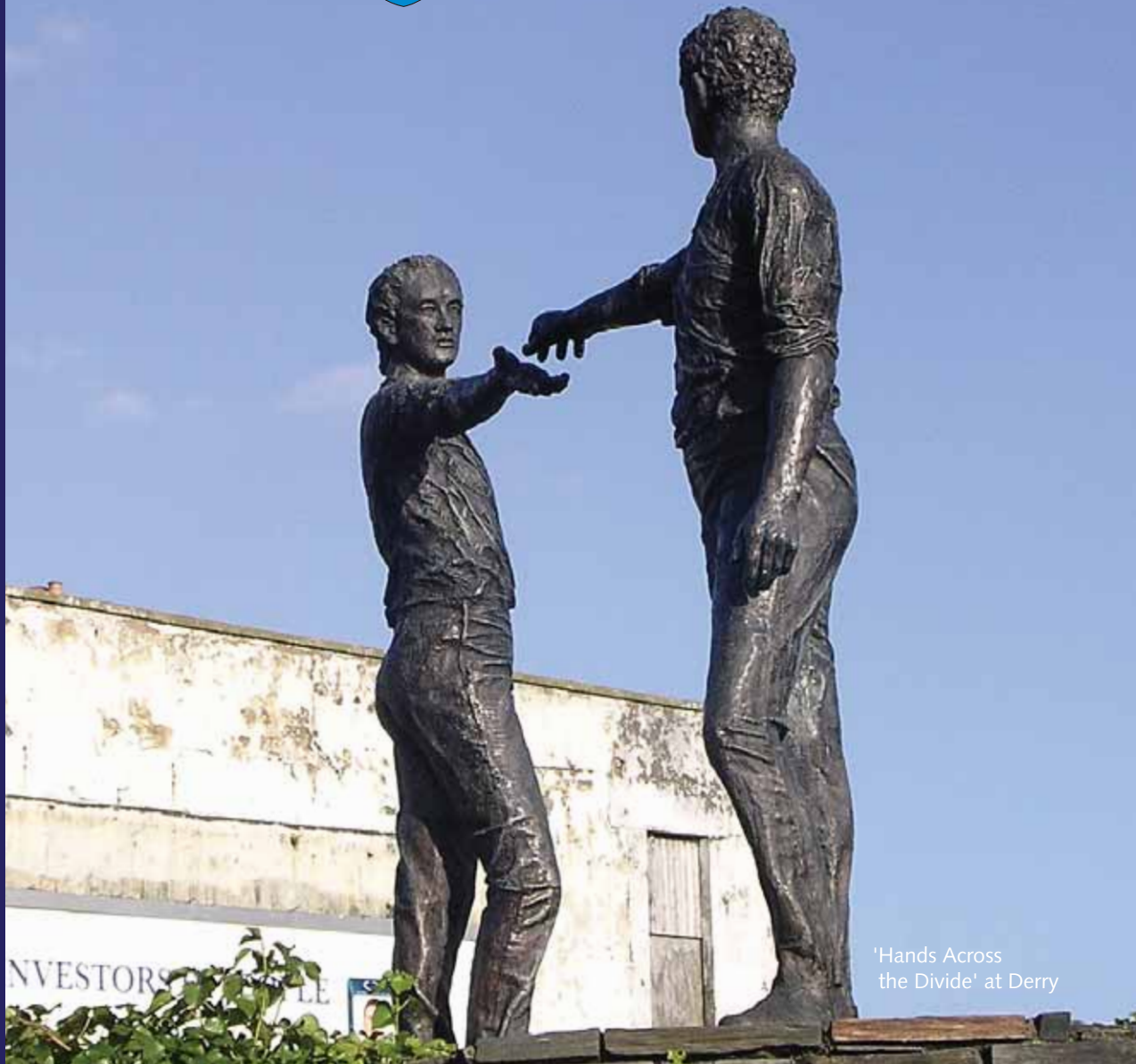
'Hands Across the Divide' at Derry