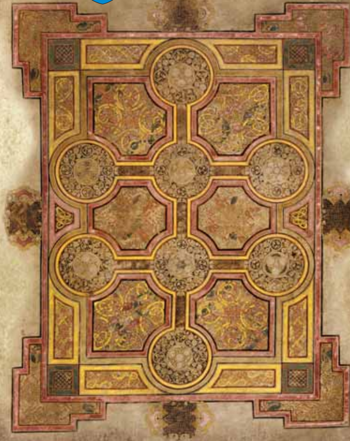
Eight circle cross from the Book of Kells