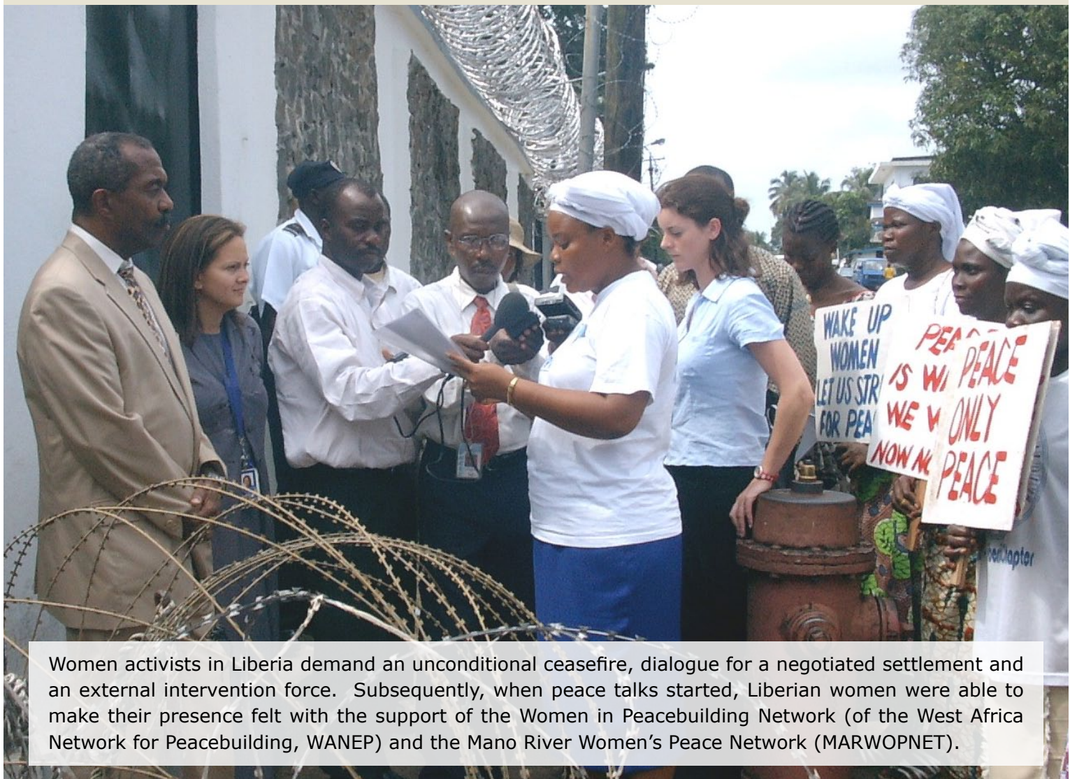
Women activists in Liberia demand an unconditional ceasefire, dialogue for a negotiated settlement and an external intervention force. Subsequently, when peace talks started, Liberian women were able to make their presence felt with the support of the Women in Peacebuilding Network (of the West Africa Network for Peacebuilding, WANEP) and the Mano River Women's Peace Network (MARWOPNET).

5. Needs of women and girls to be considered in post conflict reconstruction, demobilisation disarmament, repatriation, resettlement and the reintegration (DDRRR) of fighting forces.