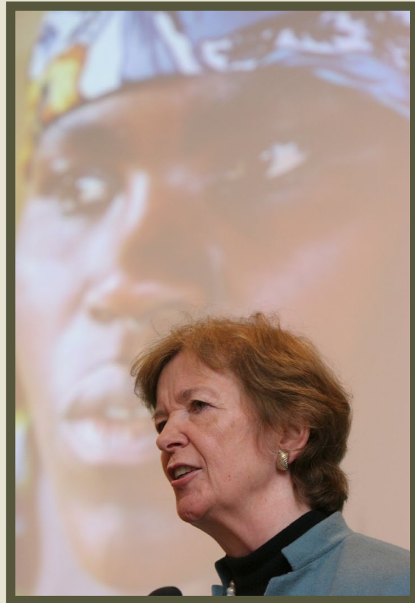
Mary Robinson (Realizing Rights)

In her work on bringing human rights objectives to a global level, Mary Robinson told participants that she has witnessed not only that conflict bears down terribly on women and their families, but their voices are not being heard. She stated that women were not passive victims, but wanted to have change and knew the kind of change they wanted to see happen. She reflected on the similarities between African countries that are suffering from violence and conflict or post conflict with Northern Ireland, and the courage of women's groups that crossed the divide, and started a process of moving forward in joint recognition that violence was not good for their young, nor for society as a whole.