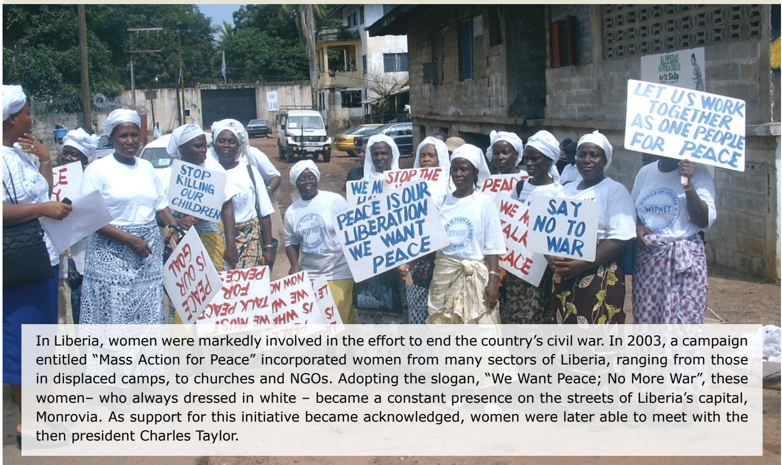
In Liberia, women were markedly involved in the effort to end the country’s civil war. In 2003, a campaign entitled “Mass Action for Peace” incorporated women from many sectors of Liberia, ranging from those in displaced camps, to churches and NGOs. Adopting the slogan, “We Want Peace; No More War”, these women- who always dressed in white – became a constant presence on the streets of Liberia’s capital, Monrovia. As support for this initiative became acknowledged, women were later able to meet with the then president Charles Taylor.