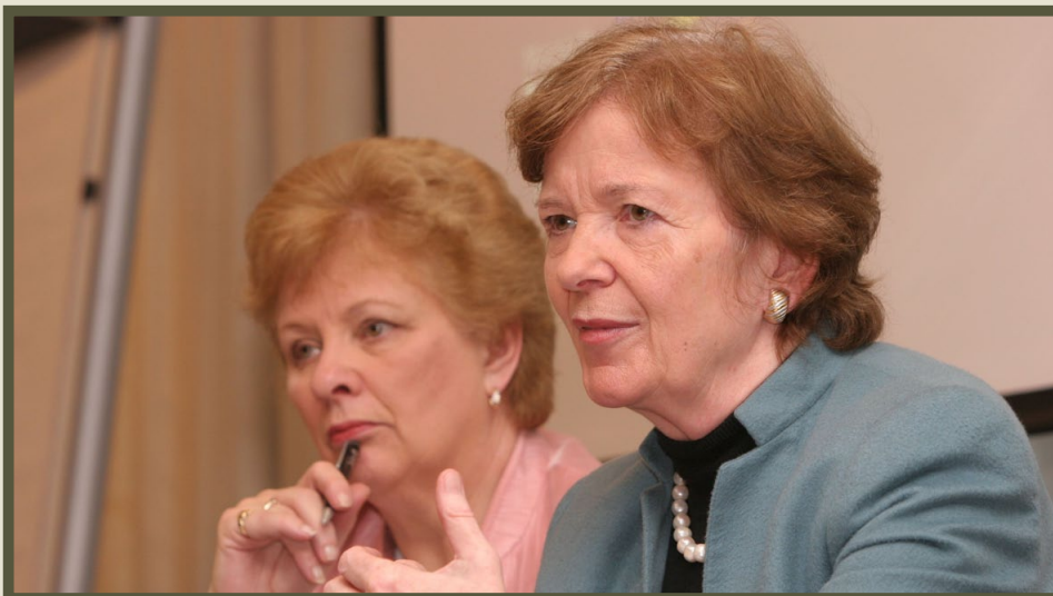
Nuala O’Loan (Government of Ireland’s Special Envoy on Security Council Resolution 1325 and to Timor Lesté) & Mary Robinson (Realizing Rights).

In terms of participation in the peace process, Inez Mc Cormack pointed out that the test of any peace agreement is not just whether it is implemented in terms of the conditions within the agreement, but also who is at the table when that agreement is made.